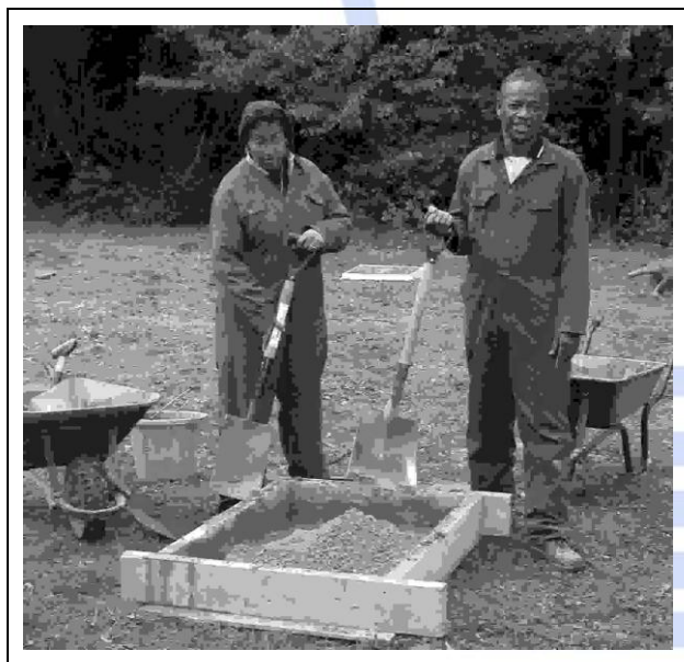
Photograph 1. The physical differences between men and women need to be considered

As infrastructure can have a positive or negative impact on women, policies have been produced to "mainstream" gender issues into the provision of watsan. However good the theory and intent, the practice is not so easy to introduce (Joshi & Fawcett). Whilst the theories and practice of gender analysis may be familiar to social scientists, they will be new to technical staff as they have not been part of general engineering training and so training will be required. Similarly, the economic issues (such as do women have control over payments for water) need to be brought into consideration. Different technical options have different payment methods.