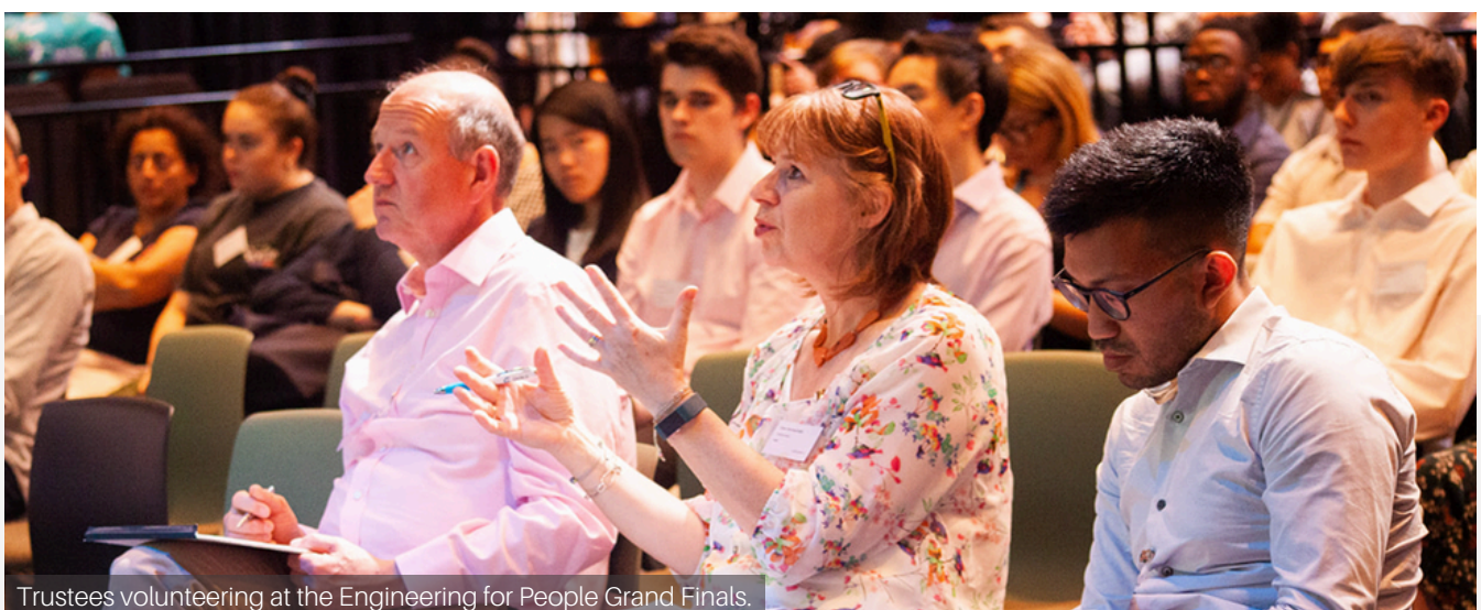
Trustees volunteering at the Engineering for People Grand Finals.

Please don't let this part of the process prevent you from nominating yourself - please contact us if you need help with this.